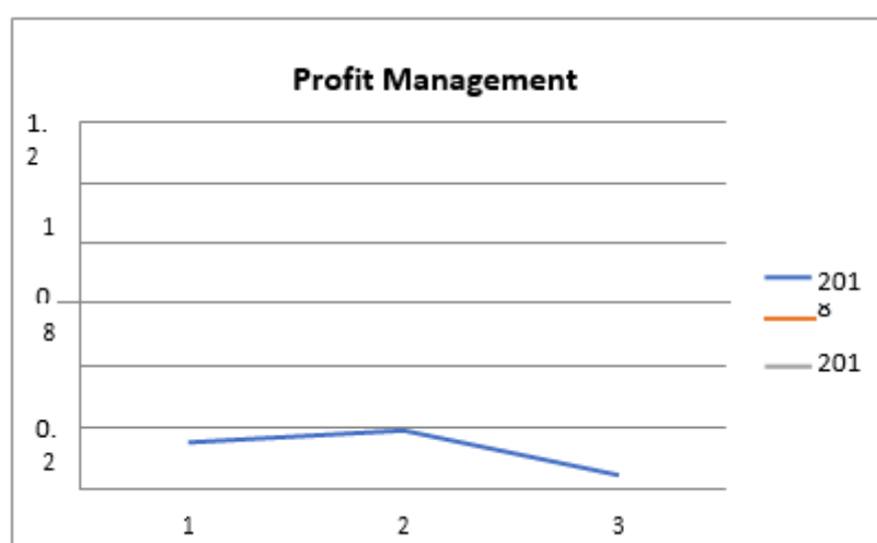
Graph 1. Profit Management

Earnings management is an effort to increase and decrease profits in compiling and presenting financial reports to benefit themselves. Some motivations for earnings management are the bonus plan hypothesis, debt to equity hypothesis, and the political cost hypothesis. The bonus plan hypothesis states that managers in companies with bonus plans tend to use accounting methods to increase current income. The debt to equity hypothesis states that in companies that have an enormous debt to equity ratio, the company's managers tend to use accounting methods that will increase revenue or profits. The political cost hypothesis states that large companies whose operations touch most of the public will tend to reduce reported profits.