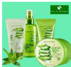
Image 2 Nature Republic products

Brand Personality is used to differentiate a product from other products. Brand personality is one of the factors that can influence consumer behavior. Companies must make their products have characteristics that other products don't have. The goal with this distinction is that consumers remember the products being marketed so that sales can increase. The brand personality of a product can be in the form of packaging, raw materials, slogans and others. [10]