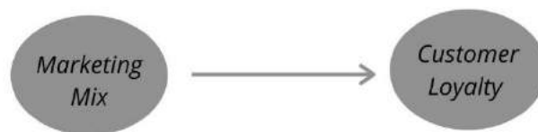
Figure 1. Research Model

Kopi Q was chosen because this coffee shop is well established since 2012. In addition, this coffee shop is still fulfilled by visitors during the COVID-19 pandemic, so we are interested to explore further the keys success of Kopi Q, in this study focused on marketing mix and customer loyalty.