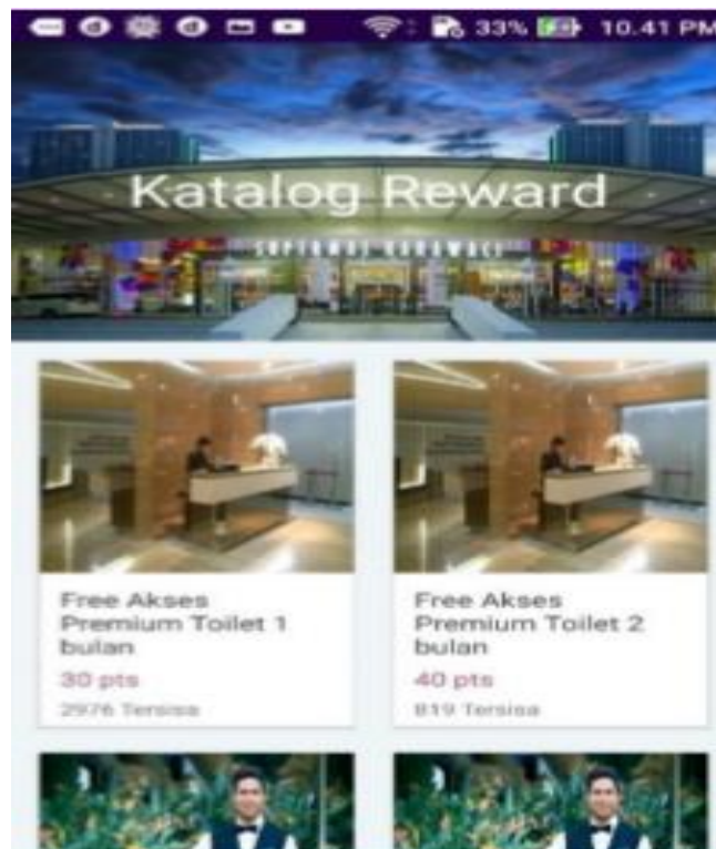
Figure 6. Display UI Reward Catalog

Note: The user interface above is an info point display to inform the accumulated user points.