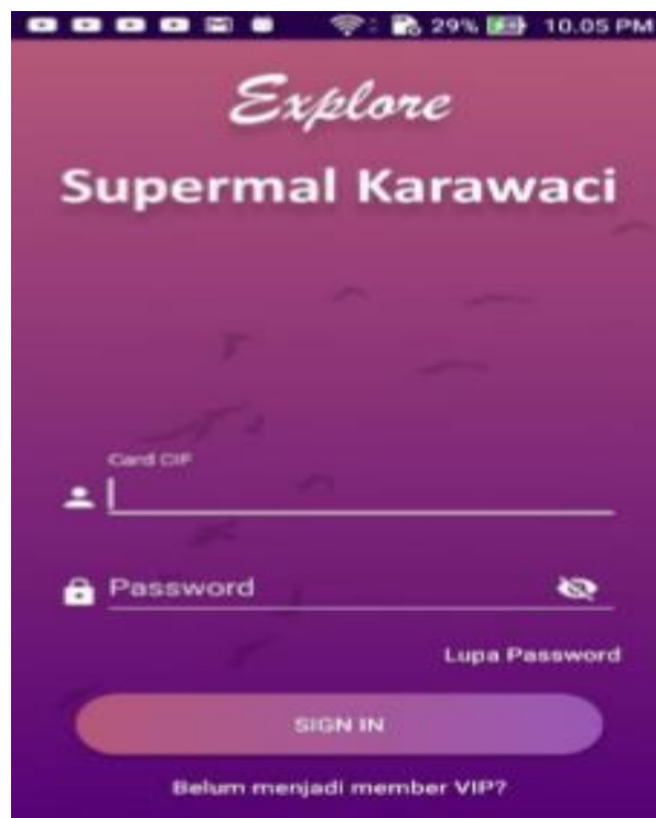
Figure 2. Display UI Sign In

Note: The user interface above is the display when the application was first launched.