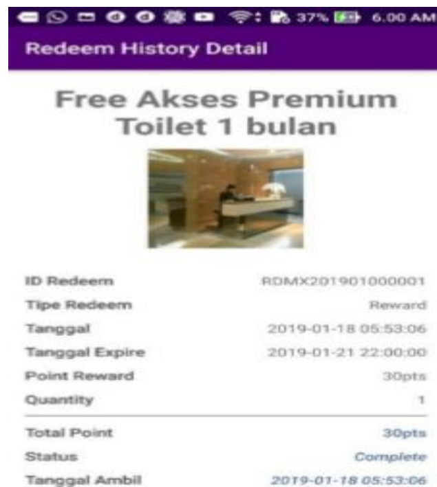
Figure 8. Display UI Redeem History Detail (Complete)

Note: On the reward reward catalog menu, customers can see information on the number of points, stock, information and the number of rewards that they want to retrieve.