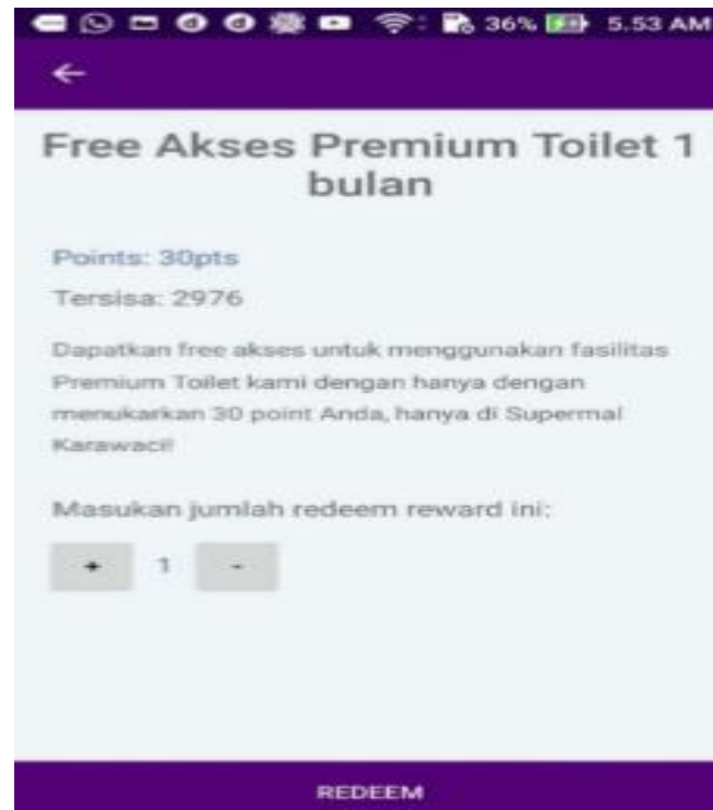
Figure 7. Display UI Reward Details Catalog

Note: On the reward reward catalog menu, customers can see information on the number of points, stock, information and the number of rewards that they want to retrieve.