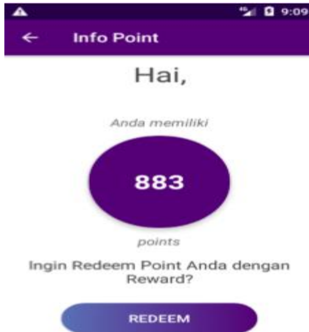
Figure 5. Display UI Info Point

Note: The user interface above is a side navigation drawer bar display for navigating the main functionality of the application.