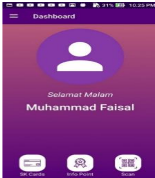
Figure 3. Display Dashboard UI (Main page)

Note: The user interface above is the main display Sign In for the user after the splashscreen of Supermal Karawaci is finished.